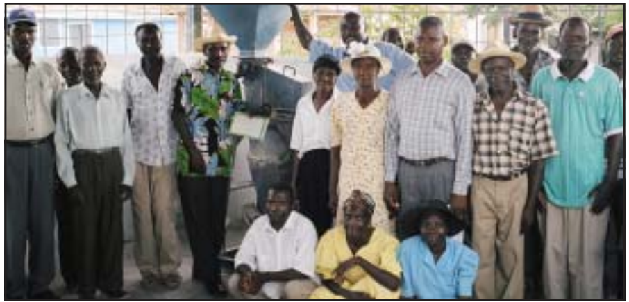
Members of a peasant group in Artibonite Valley running a grain mill funded by the Lambi Fund

The number of women leaders has increased considerably over time. A prime example is AFKB, which had a 900% increase in women members. Along with the sheer number of women in peasant organizations, it's important to stress their integration and their participation in all aspects of the organizations. In many projects, they occupy high-level management positions and have a major role in the decision-making process.