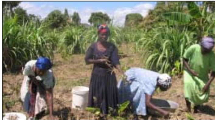
Women harvesting beans